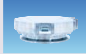
Easy-to-wipe flat surfaces