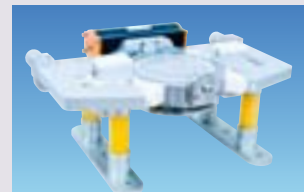
Cassette with Compensators