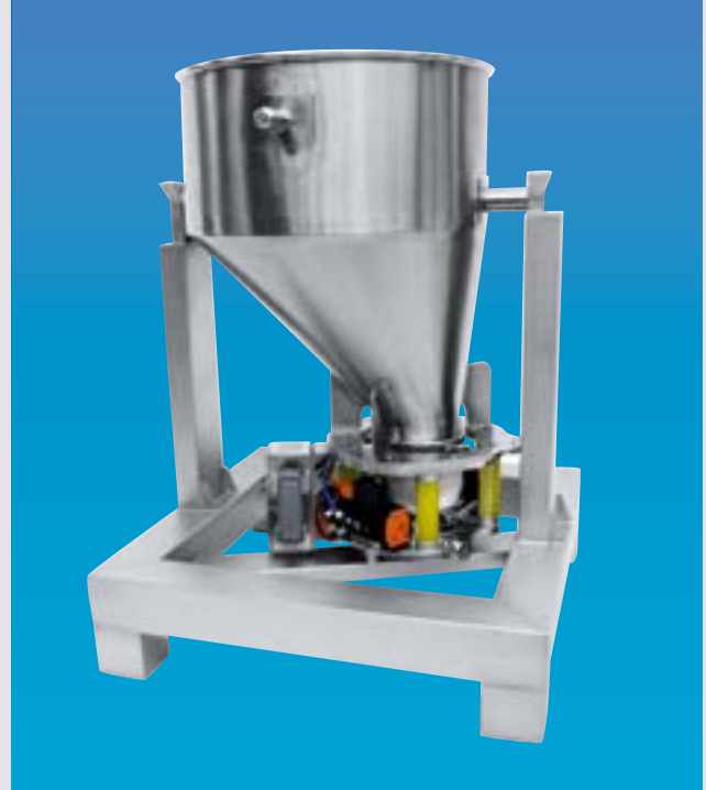
Silo with active valve – depending on the operation procedure it may be convenient to install the active valve at the vessel and the passive valve at the machine (in this case fixed to a mill).