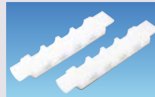
Removing tool for disk