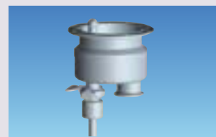
Cleaning tank with spray lance