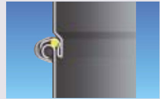
Head rim joint